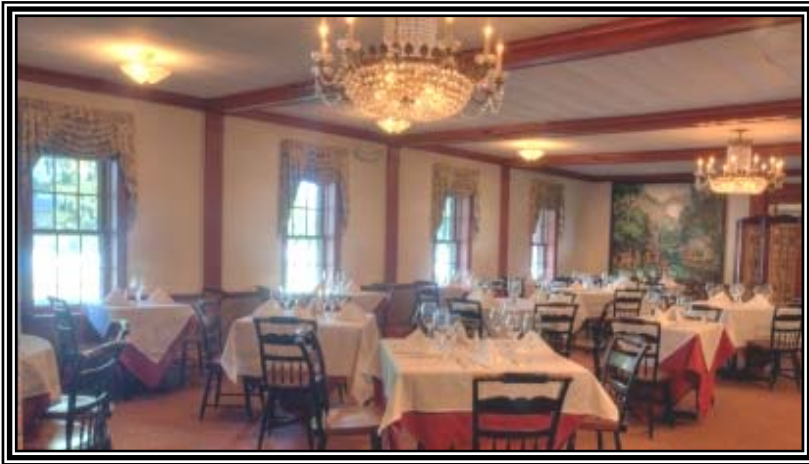
The Dining Room at Robert Morris Inn

Our function will include either a guest speaker, knowledgeable of the history of the tavern and village, or we will enjoy colonial music performed by a local musician who specializes in music of the period. We will adjourn by approximately 2:30 p.m., in time to enjoy other activities and sites in the area. A short list of nearby attractions and activities is presented on page 7. Attendees also may wish to check the internet for more activities in the area. The Inn is present on the internet at www.robertmorrisinn.com , where details about the Inn's other activities may be found.