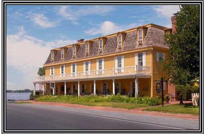
Robert Morris Inn